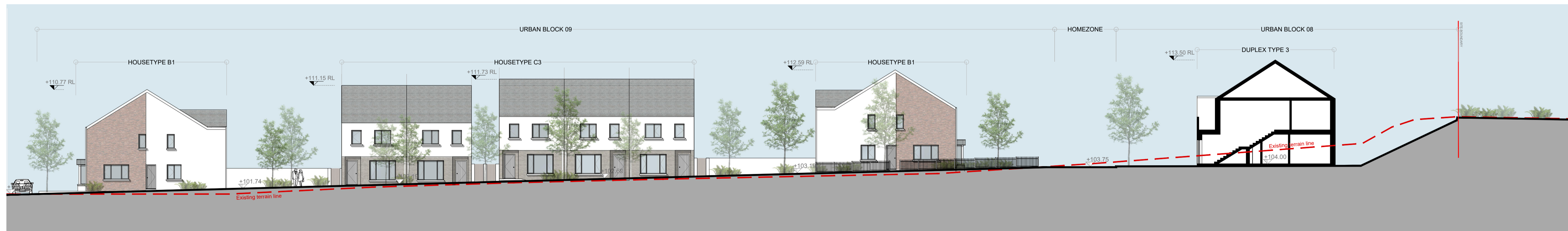
3 PROPOSED SITE SECTION 2-2 2/2 1:200

Notes: Do not scale from this drawing. Use figured dimensions in all cases. Verify dimensions for the site and report any discrepancies to the architect immediately. This drawing to be read in conjunction with the Architects Specification, Fire Certificate, D.A.C. other consultants and reports. Contractor is responsible for: 1. All dimensions, quantities and performance requirements to be confirmed on site. 2. All information and orders sent to the fabricator processes or to the manufacturer of construction. 3. All coordination of the work of all trades. 4. Allowing tolerances with the correct documents. © This drawing is copyright and may only be reproduced with the architect's permission.